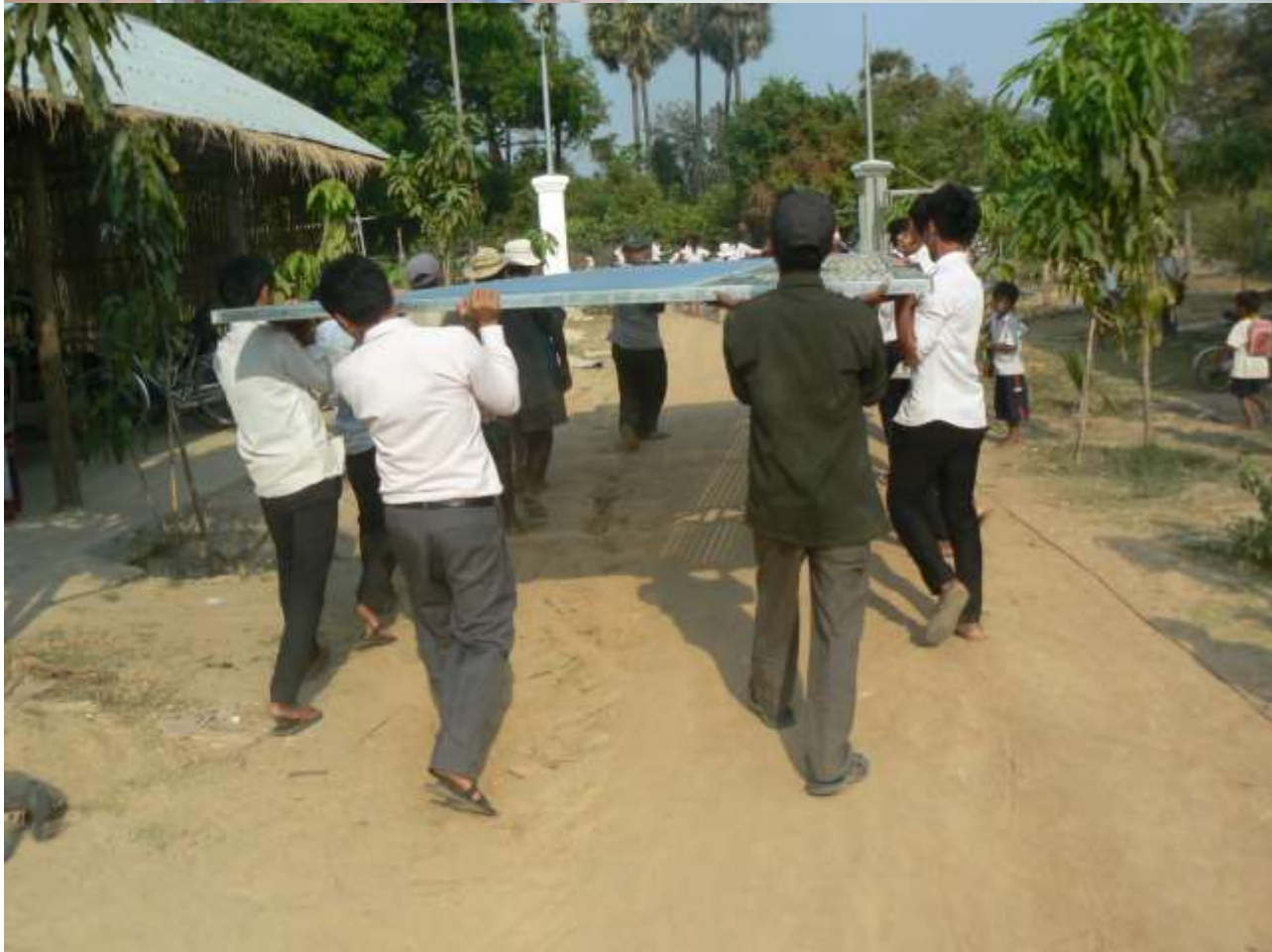
[KAD - 2013 Annual Report]