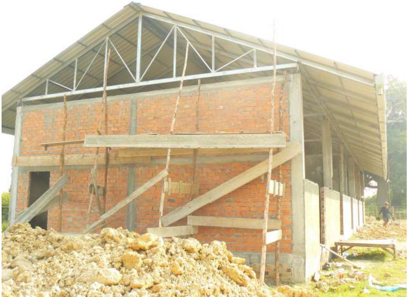
[KAD - 2013 Annual Report]