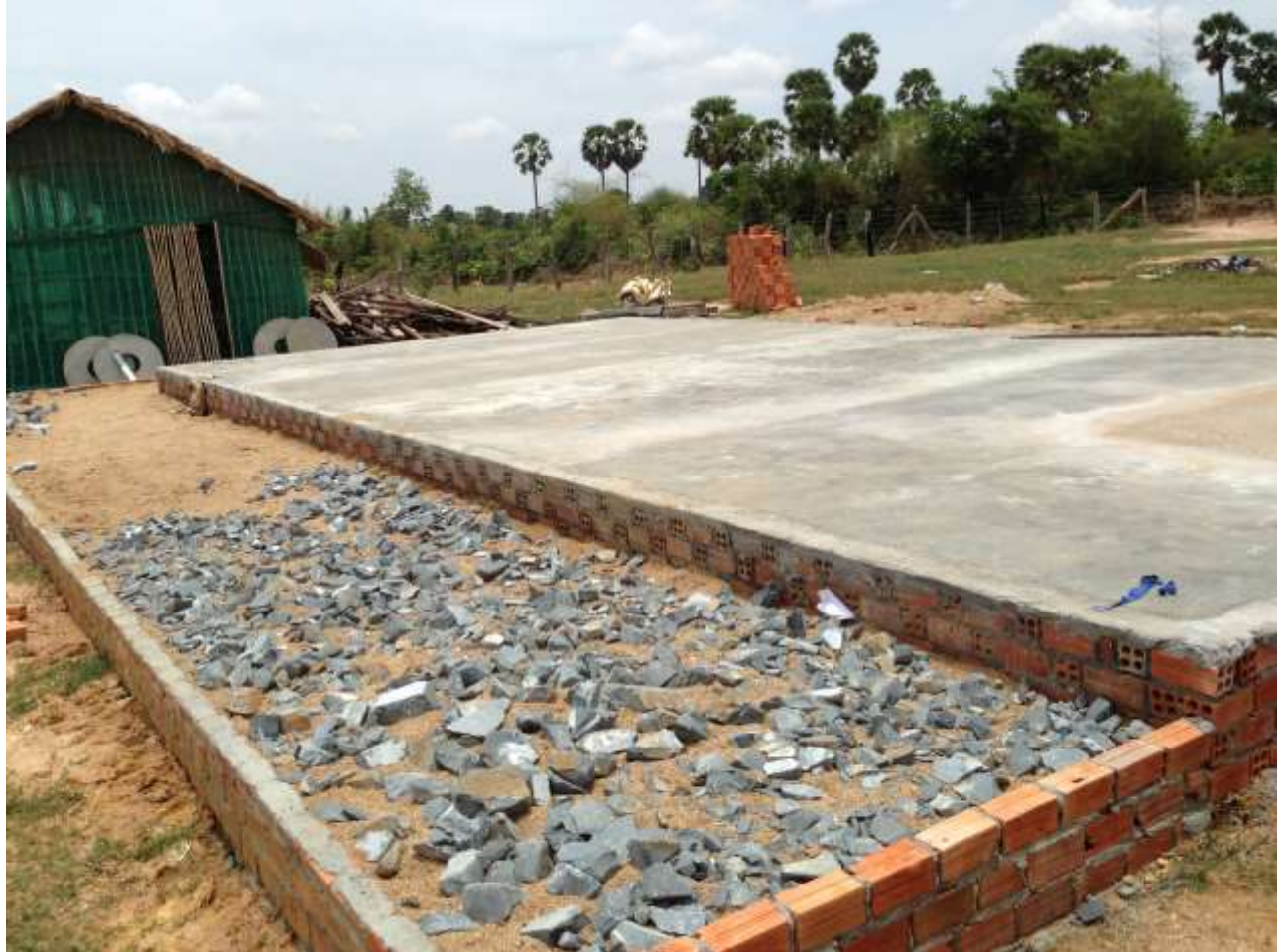
[KAD - 2013 Annual Report]