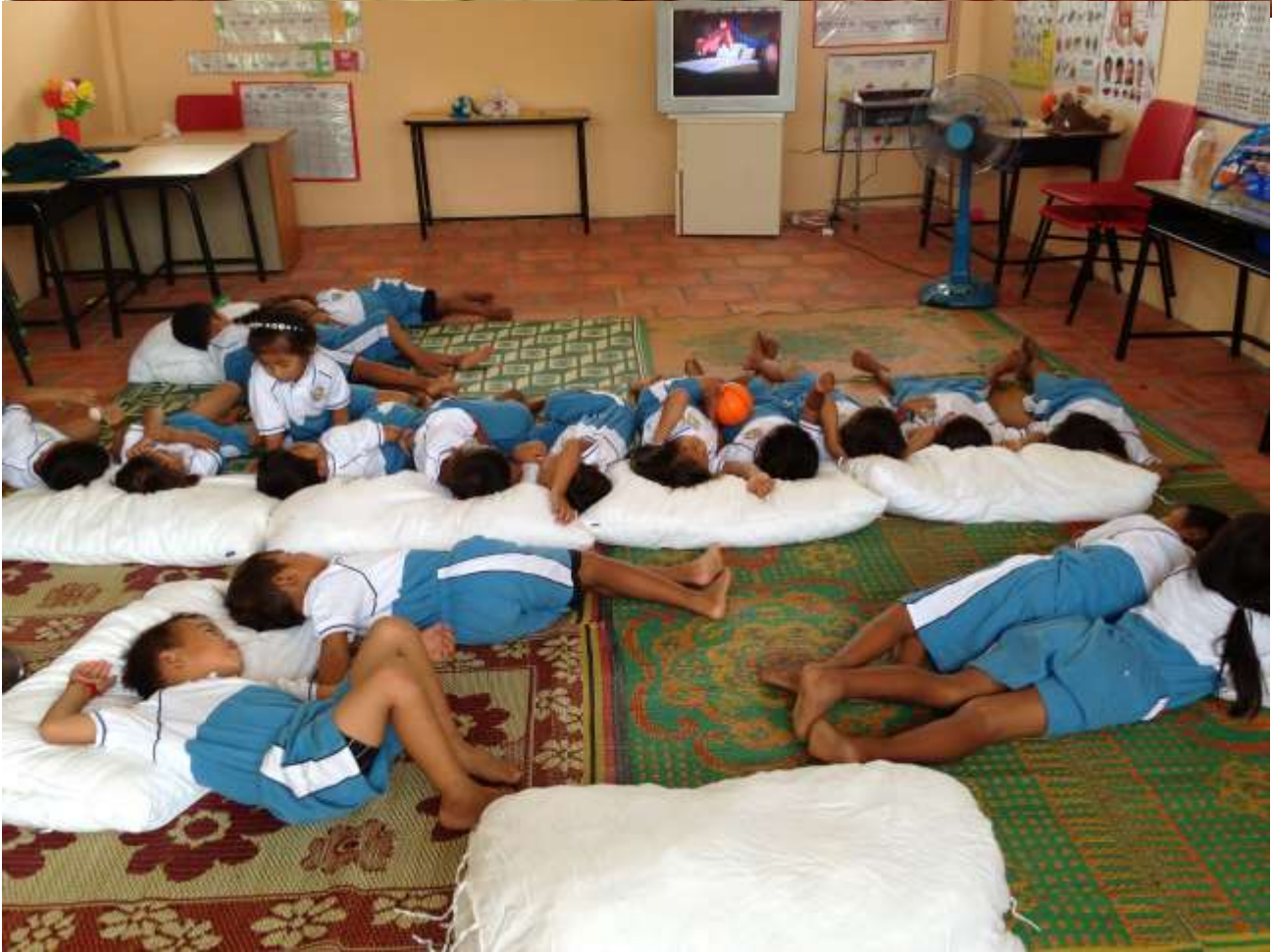
[KAD - 2013 Annual Report]