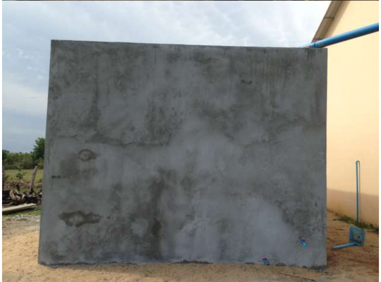
[KAD - 2013 Annual Report]