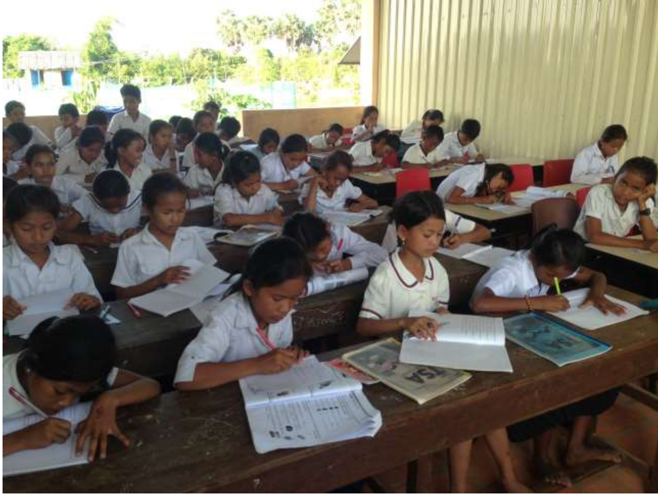
[KAD - 2013 Annual Report]