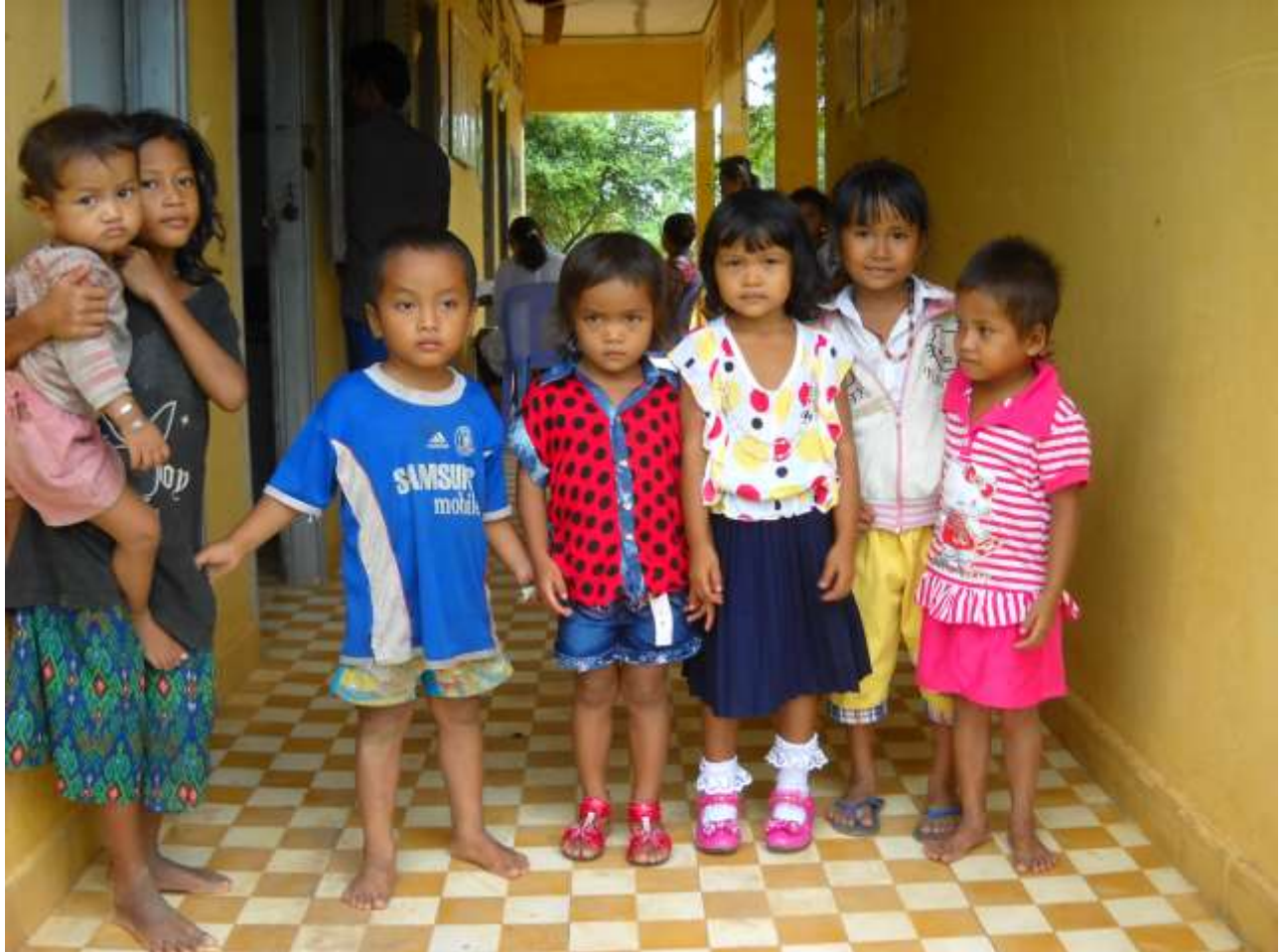
[KAD - 2013 Annual Report]