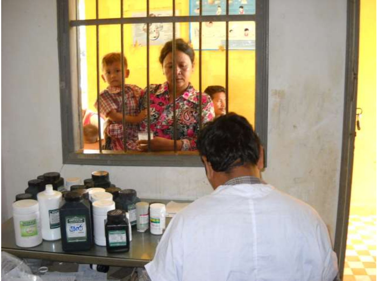
[KAD - 2013 Annual Report]