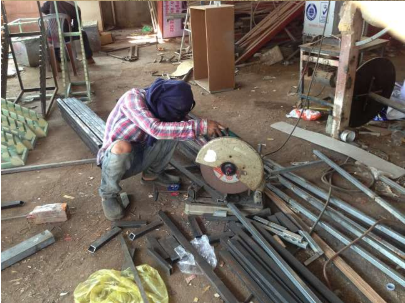
[KAD - 2013 Annual Report]