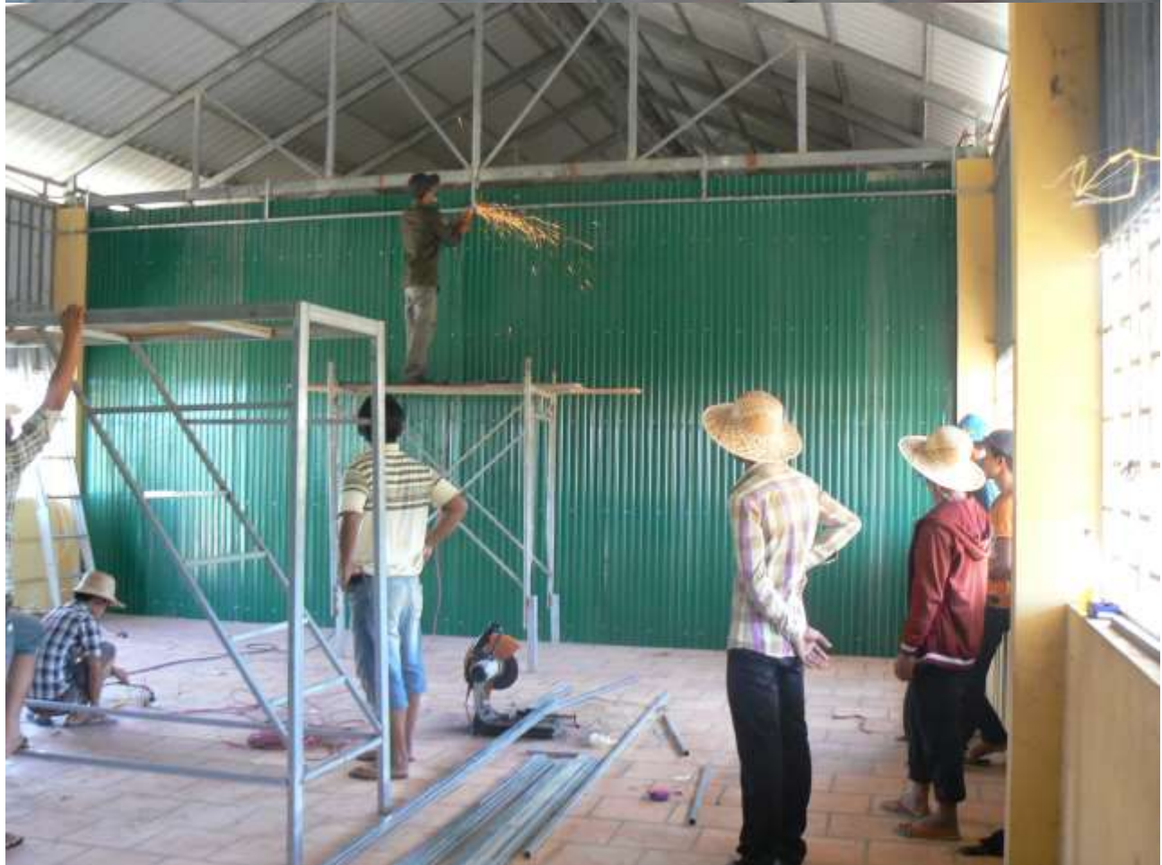
[KAD - 2013 Annual Report]