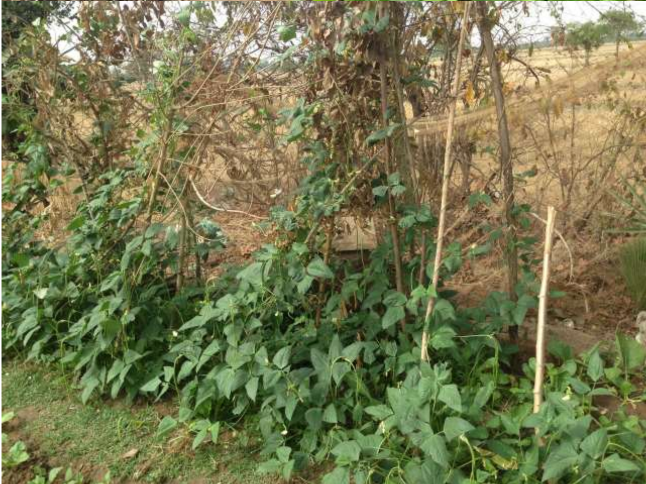
[KAD - 2013 Annual Report]