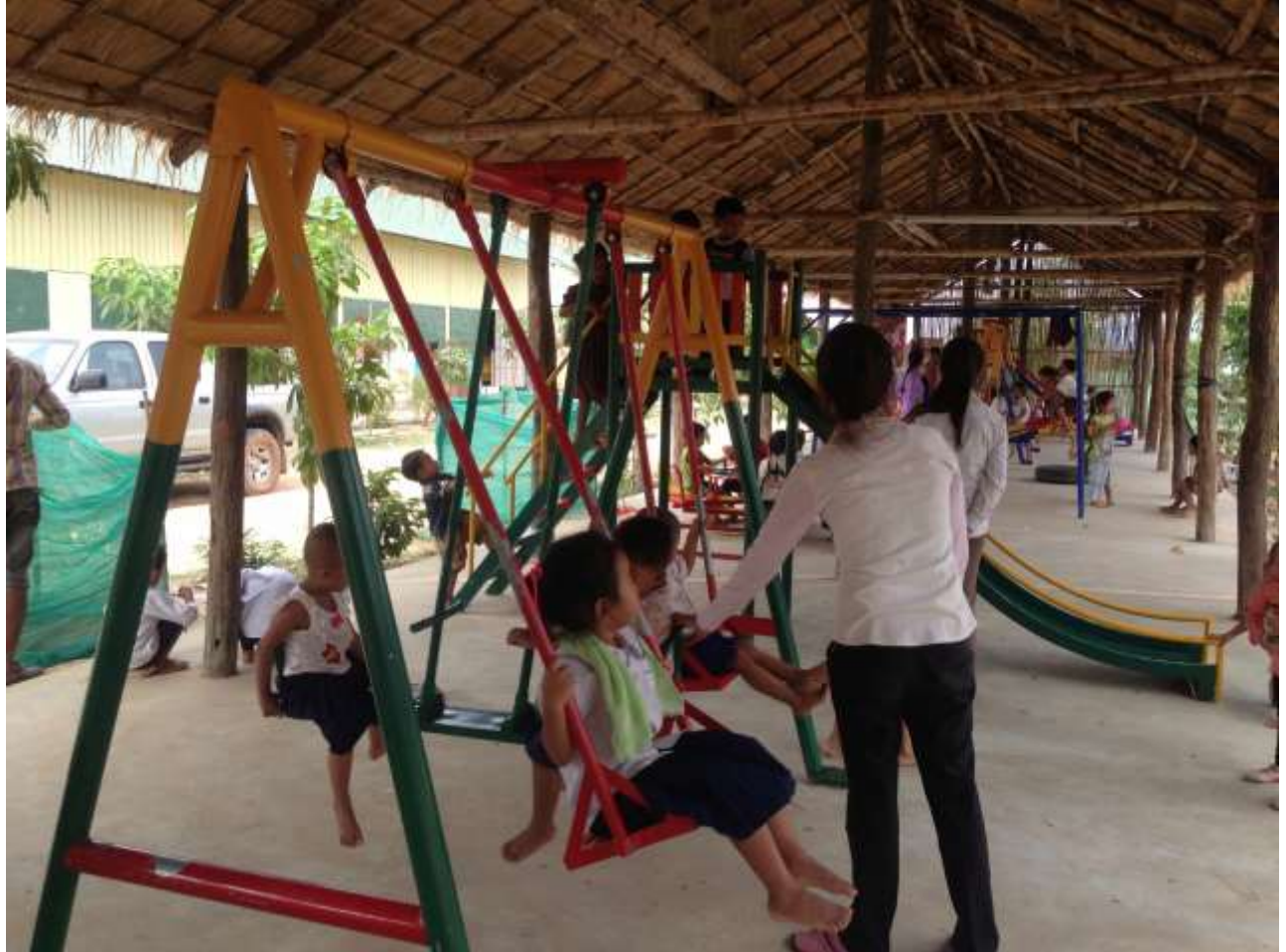
[KAD - 2013 Annual Report]