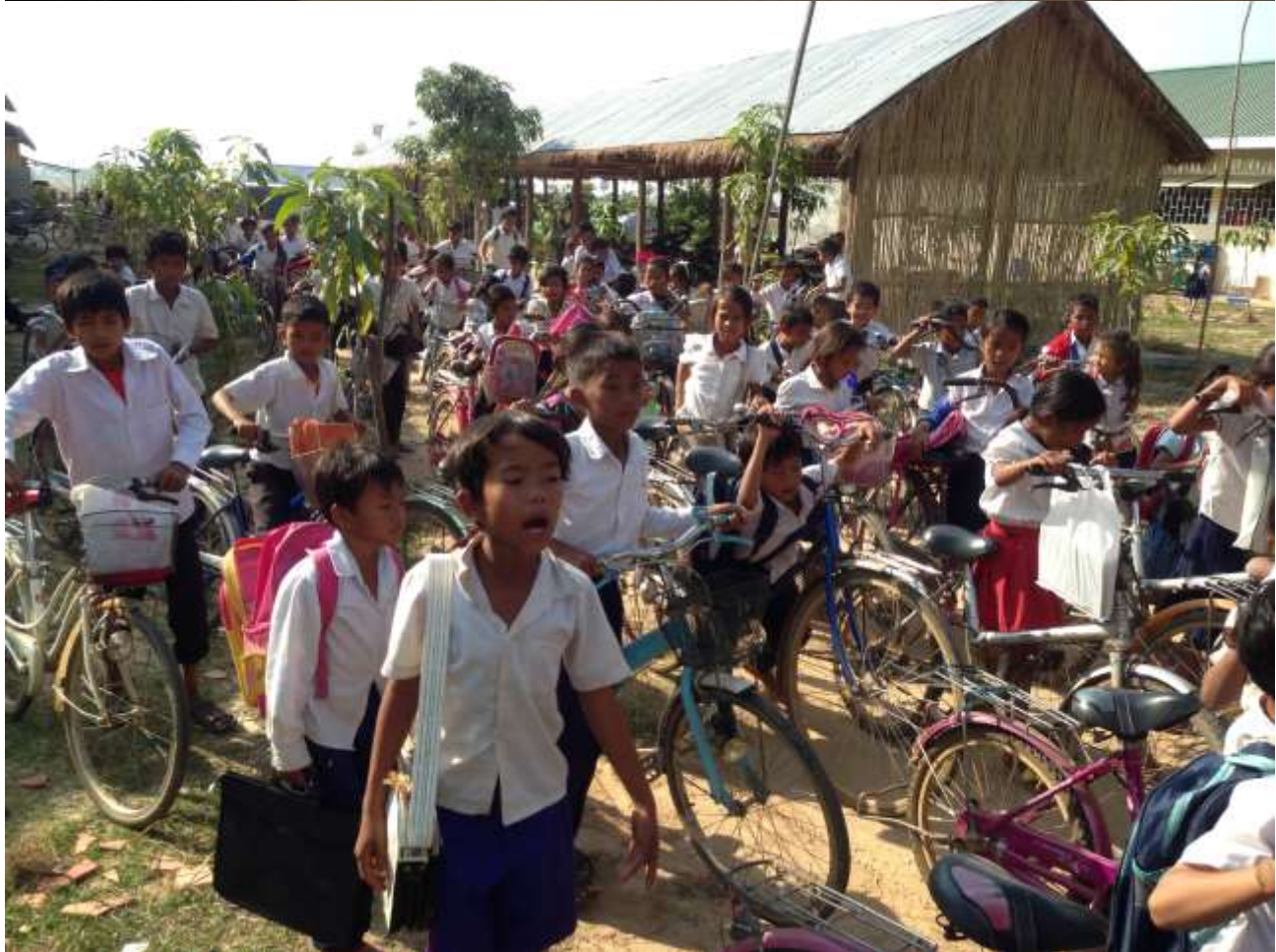
[KAD - 2013 Annual Report]