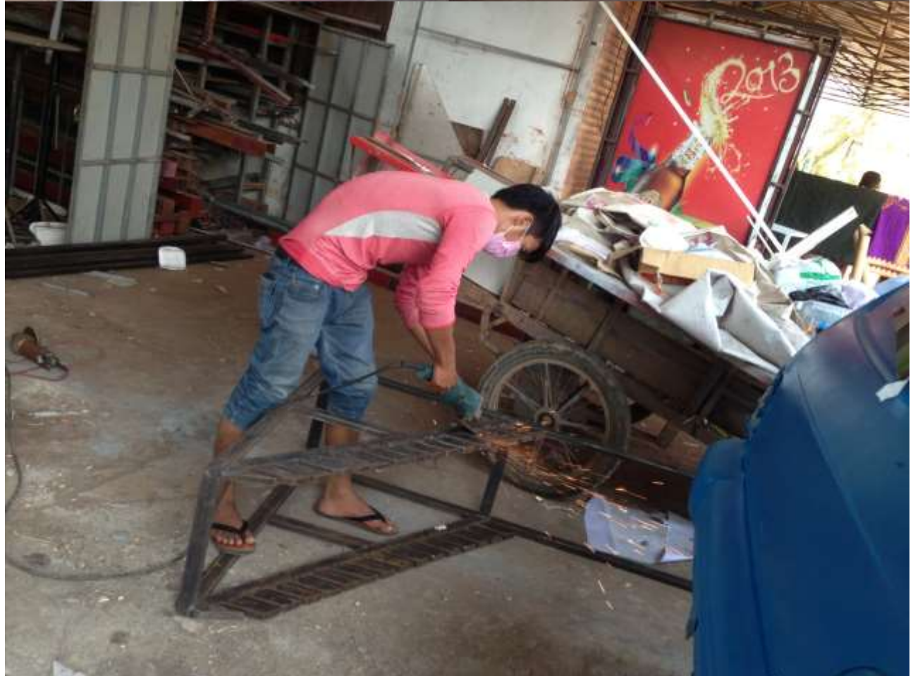
[KAD - 2013 Annual Report]