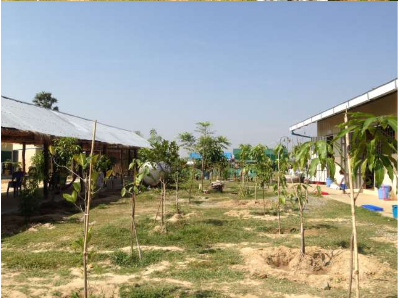
[KAD - 2013 Annual Report]