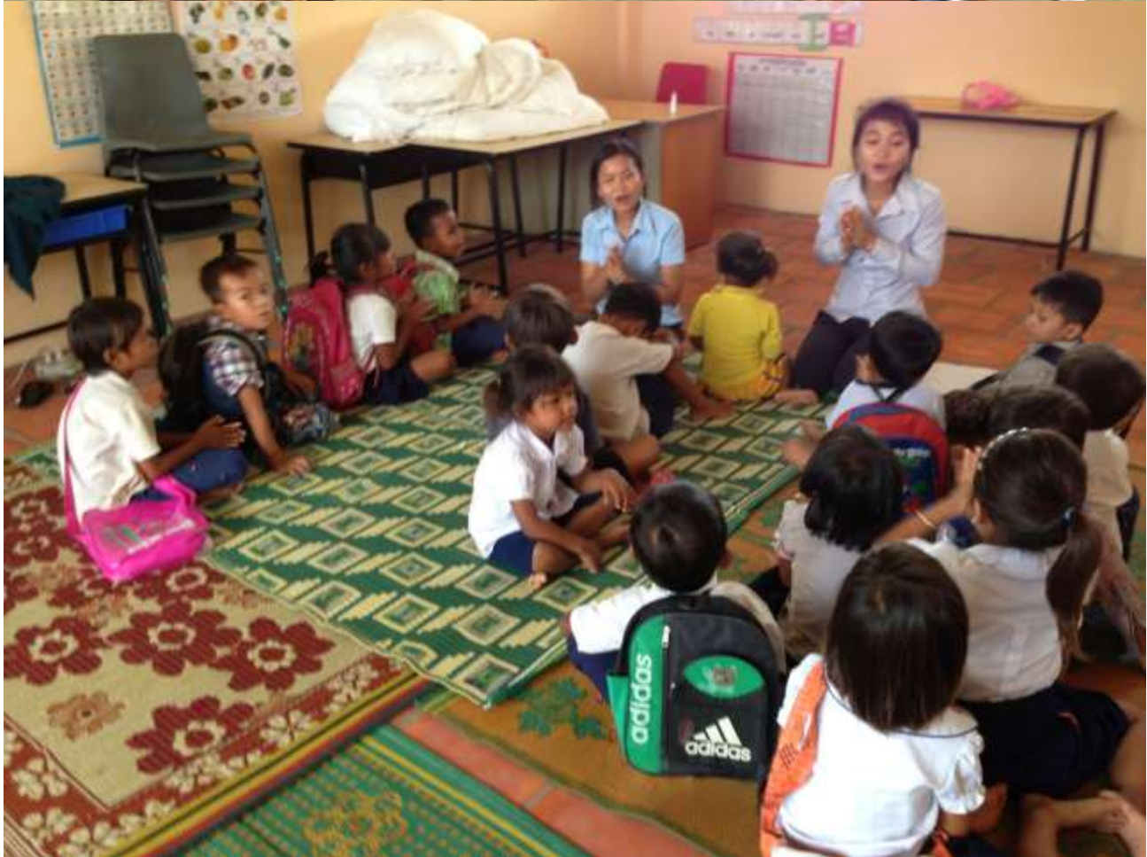
[KAD - 2013 Annual Report]