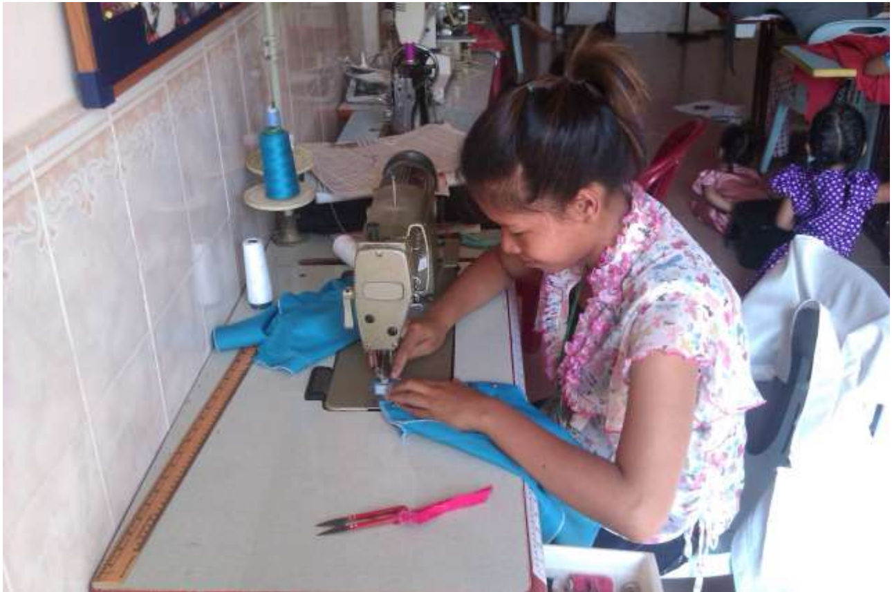
[KAD - 2013 Annual Report]