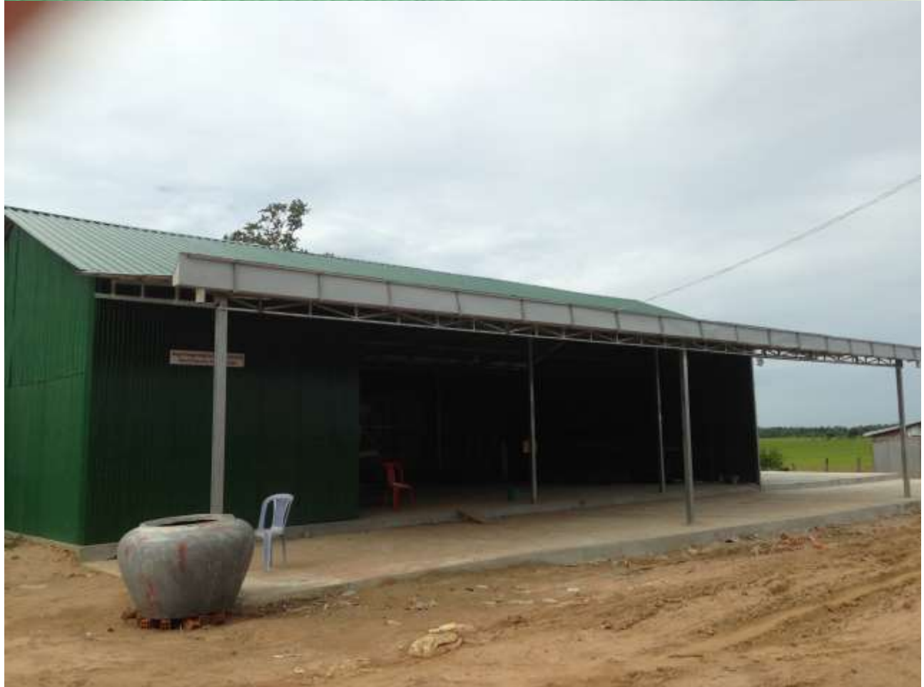
[KAD - 2013 Annual Report]