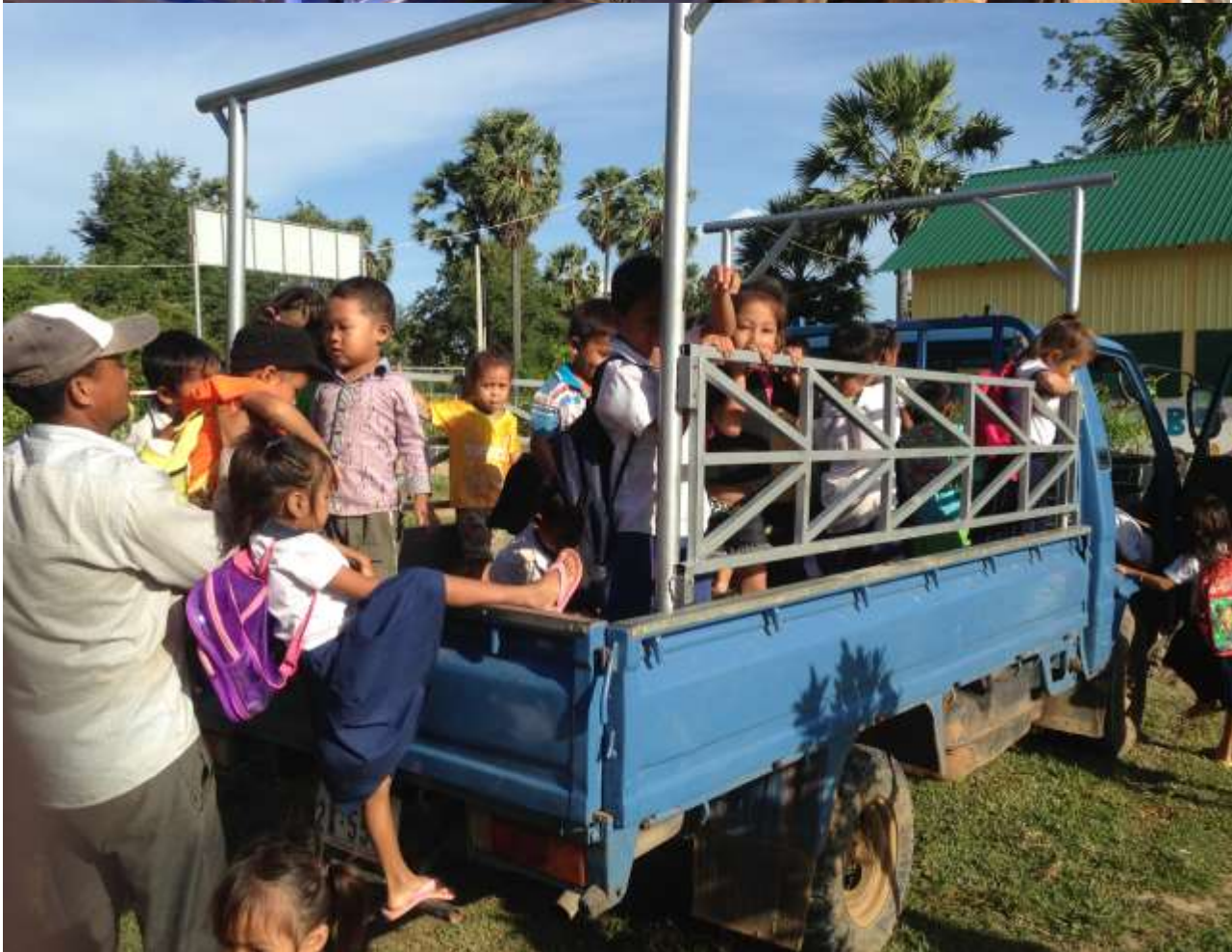
[KAD - 2013 Annual Report]