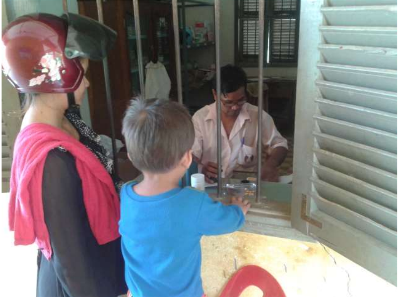
[KAD - 2013 Annual Report]